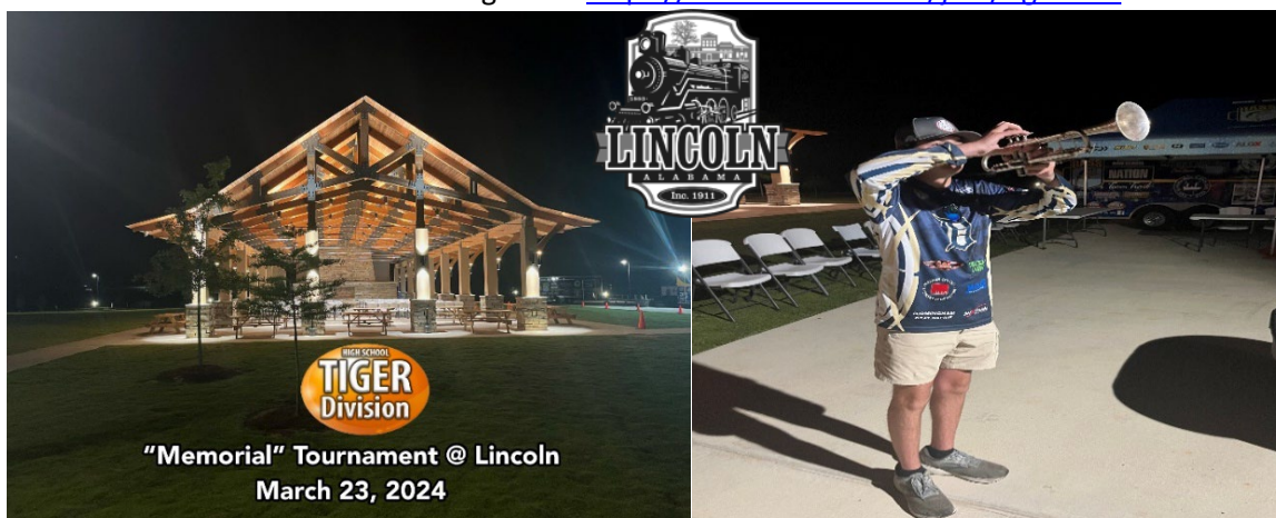
"Memorial" Tournament @ Lincoln March 23, 2024

Names ending in I-Z: https://www.remind.com/join/tigerdivb