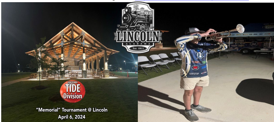
"Memorial" Tournament @ Lincoln April 6, 2024

Names ending in I-Z: https://www.remind.com/join/tidedivb